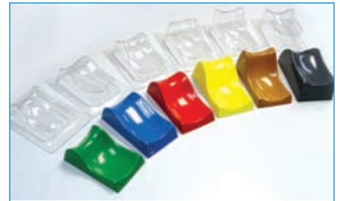
RT-8200 Timo RT-8100 Silverman