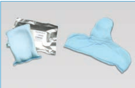
RT-6200 MoldCare® RT-6201 Head & Shoulder MoldCare®