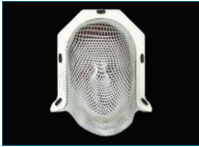
RT-460VHA 2.4 mm RT-461VHA 3.2 mm