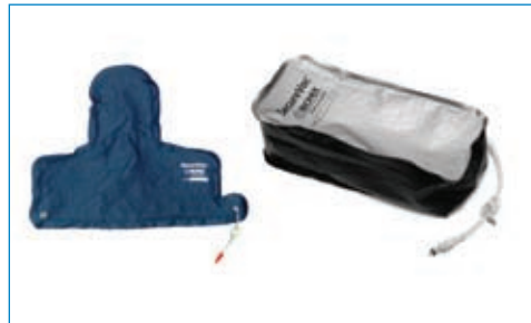
RT-7715 Head & Shoulder SecureVac™ Cushion RT-7135 VersaCushion™