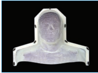
RT-460VA 2.4 mm RT-461VA 3.2 mm

Reinforced thermoplastic masks are also available.