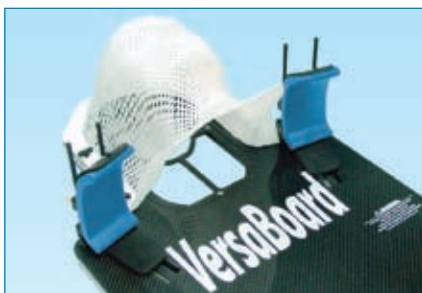
RT-6042 Premium Carbon Fiber Shoulder Suppression