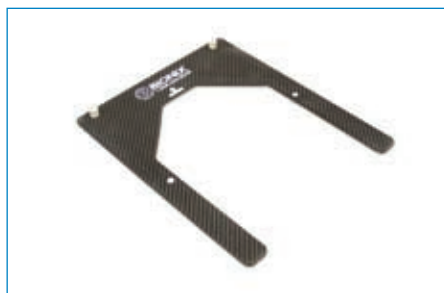
RT-7045 VersaBoard Adapter