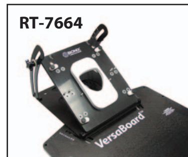
45° attachment with SuProne Plus on VersaBoard

To order, or for more information call Bionix Radiation Therapy at 1.800.624.6649 or visit us on the web at www.BionixRT.com .