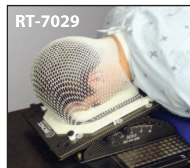
The Prone attachment