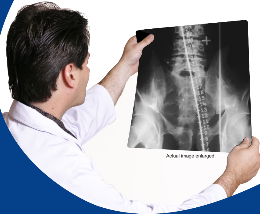
Actual image enlarged